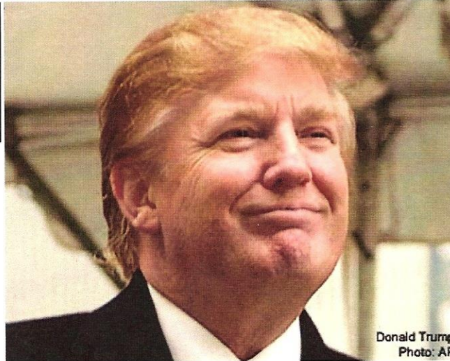
Donald Trump

August 12, 2005 -- DONALD Trump has joined the blogosphere. In his first posting on "The Trump Blog" on the Trump University Web site, the tycoon lambastes disgraced Tyco CEO Dennis Kozlowski , who is awaiting sentencing for swindling hundreds of millions of dollars from his company. "The people at the forefront of these squalid affairs give business a bad name. Maybe they are greedy, maybe they're 'ethically challenged,' but ultimately they're incompetent. If you have to lie, cheat and steal, you're just not doing it right," says The Donald, who also attacks Kozlowski for his "tackiness." "My biggest problem with Kozlowski wasn't the alleged corruption, but the lack of taste."